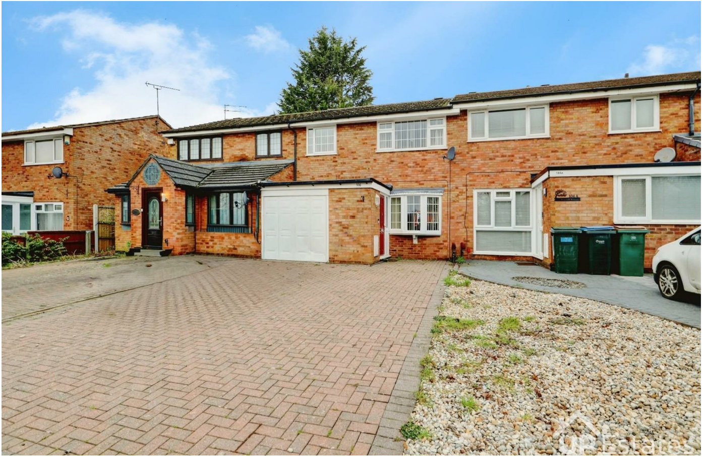
Dorchester Way, Coventry