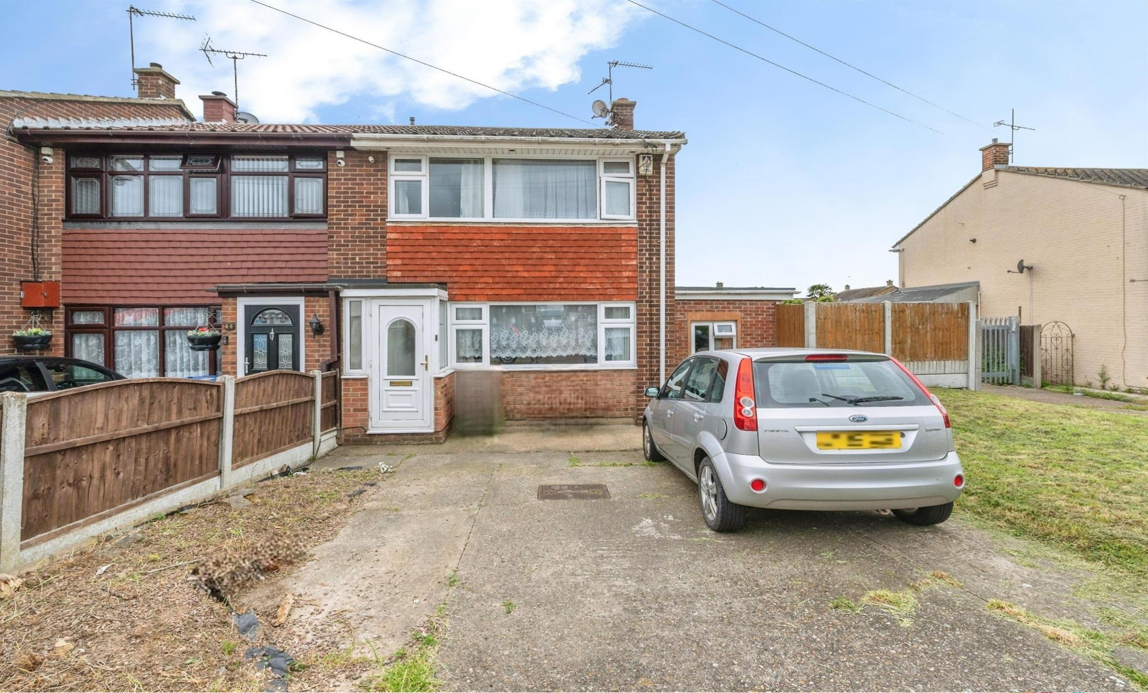
Byron Gardens, Tilbury RM18 8BD