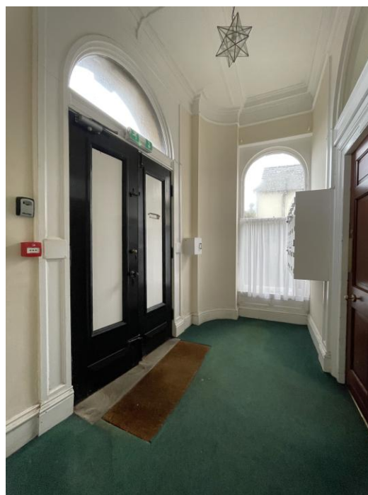
Communal Entrance Lobby

The property has been recently upgraded with a new shower suite installed in place of the former bathroom. The modern white suite includes a glazed shower cubicle with thermostatic shower and wet-walling, a pedestal wash hand basin and a low flush WC. The room has an extractor fan and a chrome ladder style central heating towel radiator.