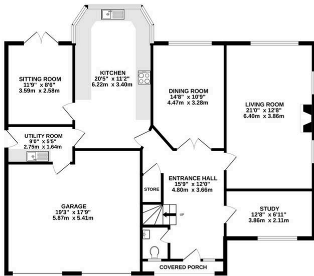
GROUND FLOOR 1431 sq.ft. (132.9 sq.m.) approx.