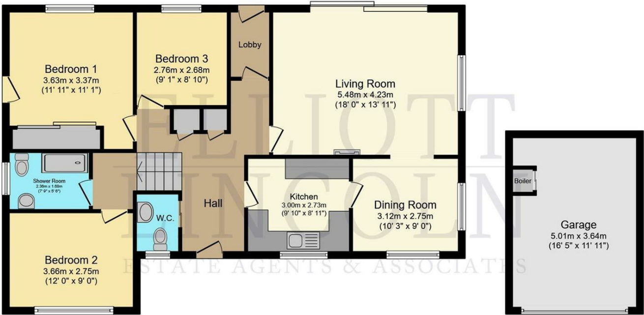
Floor Plan Floor area 100.0 sq.m. (1,076 sq.ft.)

Call or WhatsApp: 01983 642622 office@elliottlincoln.co.uk www.elliottlincoln.co.uk