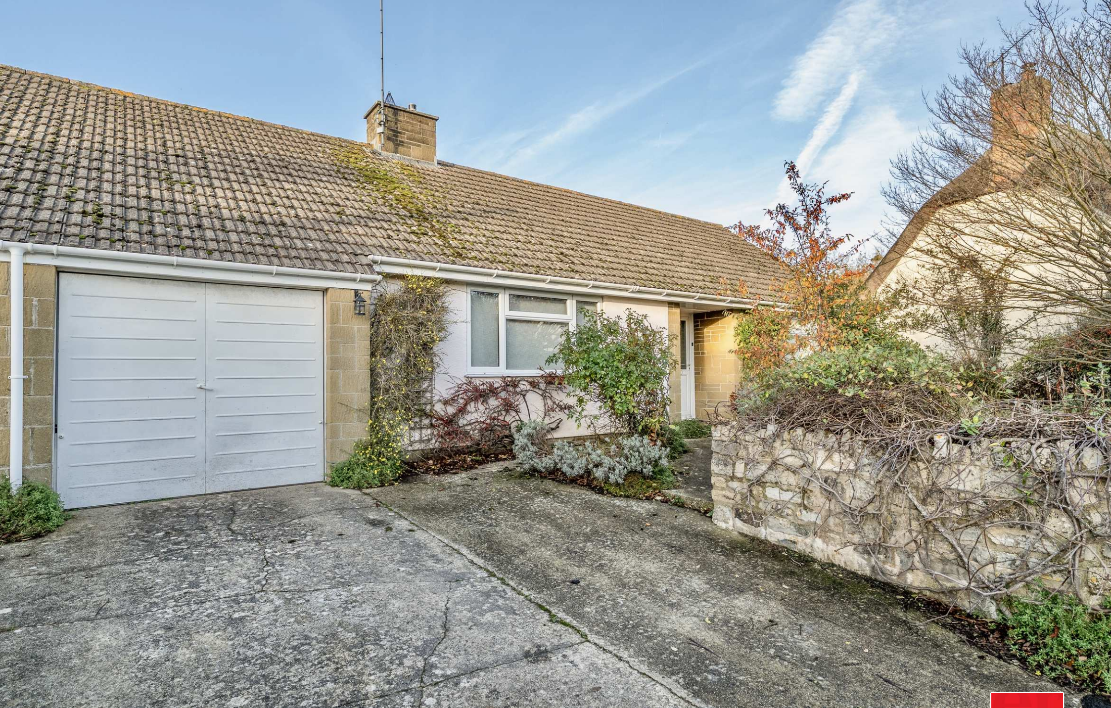
The Croft, Stoke St. Mary, Taunton TA3 5BY