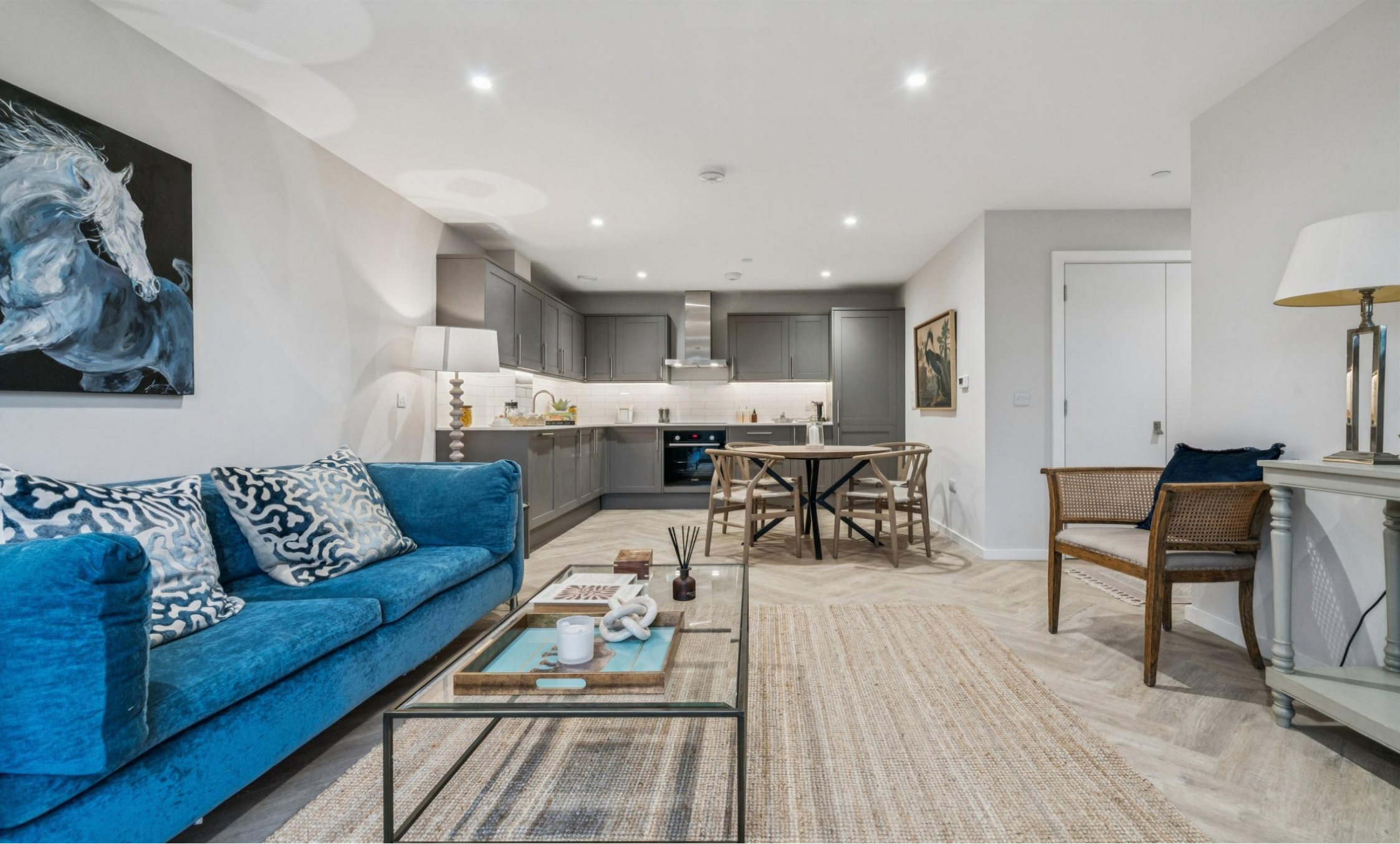
Meadow House Fallsbrook Road, London SW16 6DY