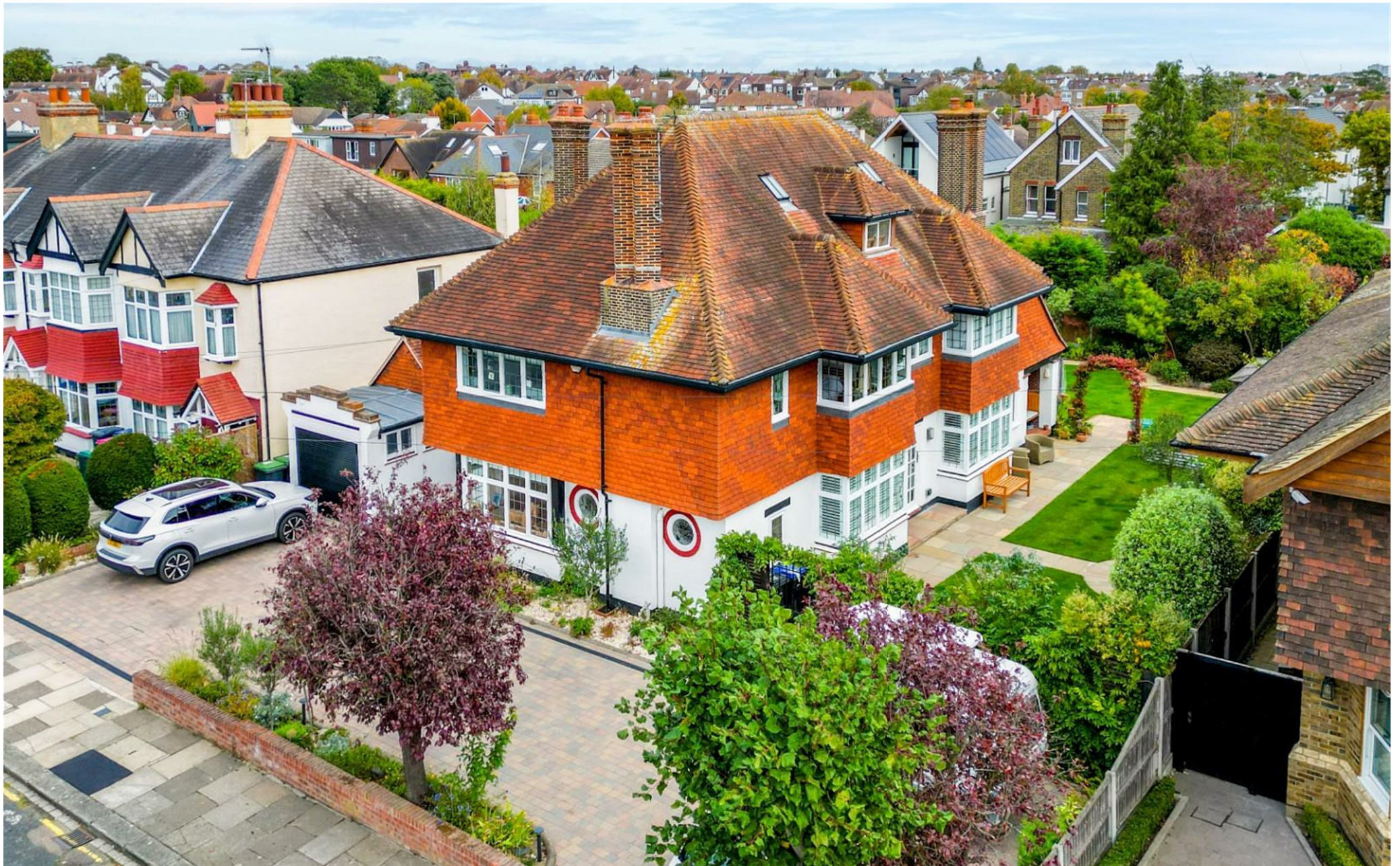
Herschell Road, Leigh-On-Sea £1,550,000