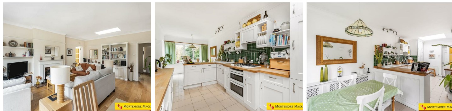
Approximate Gross Internal Area 1318 sq ft - 122 sq m (Including Garage)