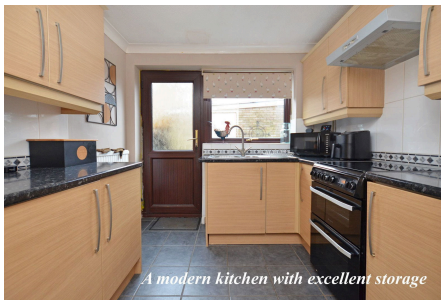
A modern kitchen with excellent storage