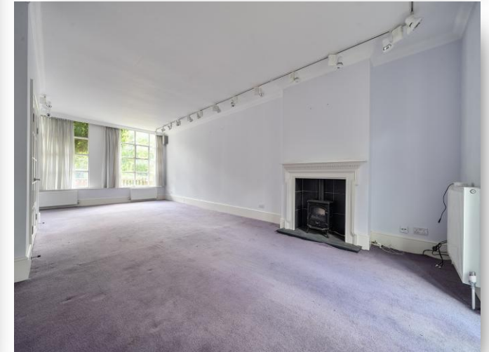
Lavender House, Bigfrith Lane, Cookham, Maidenhead SL6 9PH