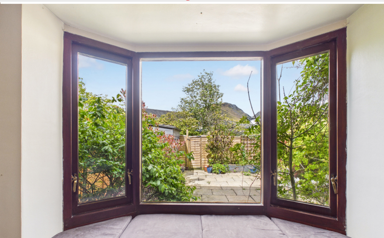
Living Room Bay Window