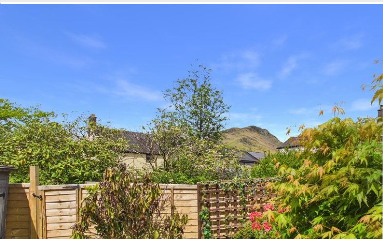
Views from Patio

The accommodation is accessed via a recessed porch with useful storage cupboard, which leads you into a hallway with a cloaks room with WC, wash basin with tiled splash back and Worcester Greenstar boiler.