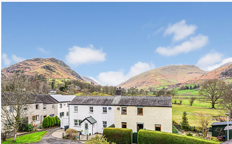
Views from Front Elevation