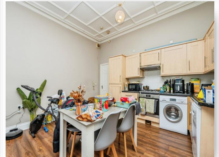
St Augustines Road, Birmingham B16 9JU