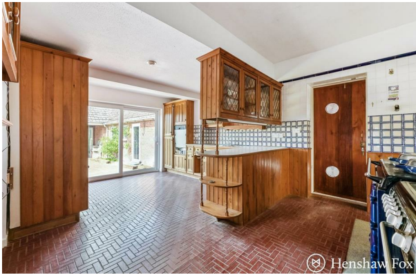
Erlcombe Butts Green | £775,000 Lockerley, Hampshire, SO51 0JG