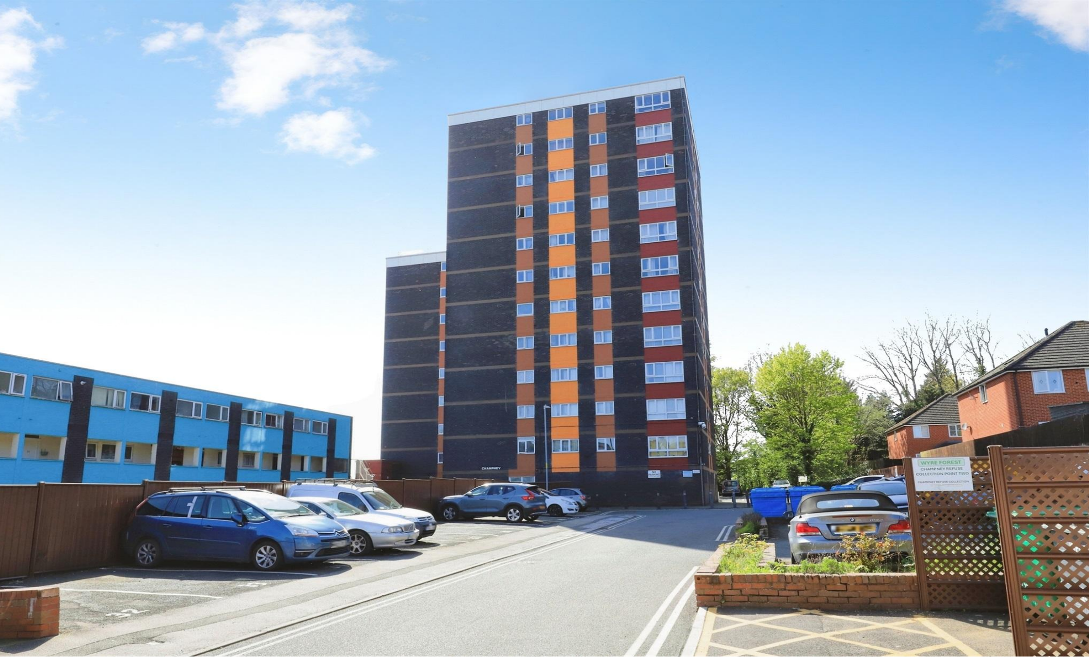
Champney St. Cecilia Close, Kidderminster DY10 1LW