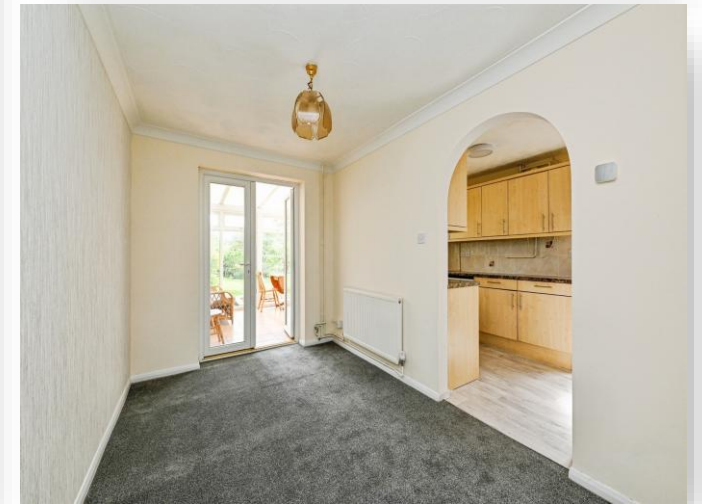
Blackford, King's Lynn, PE30 3UL