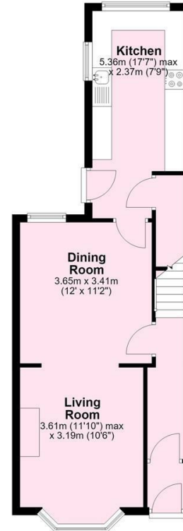
Ground Floor Approx. 44.4 sq. metres (477.8 sq. feet)