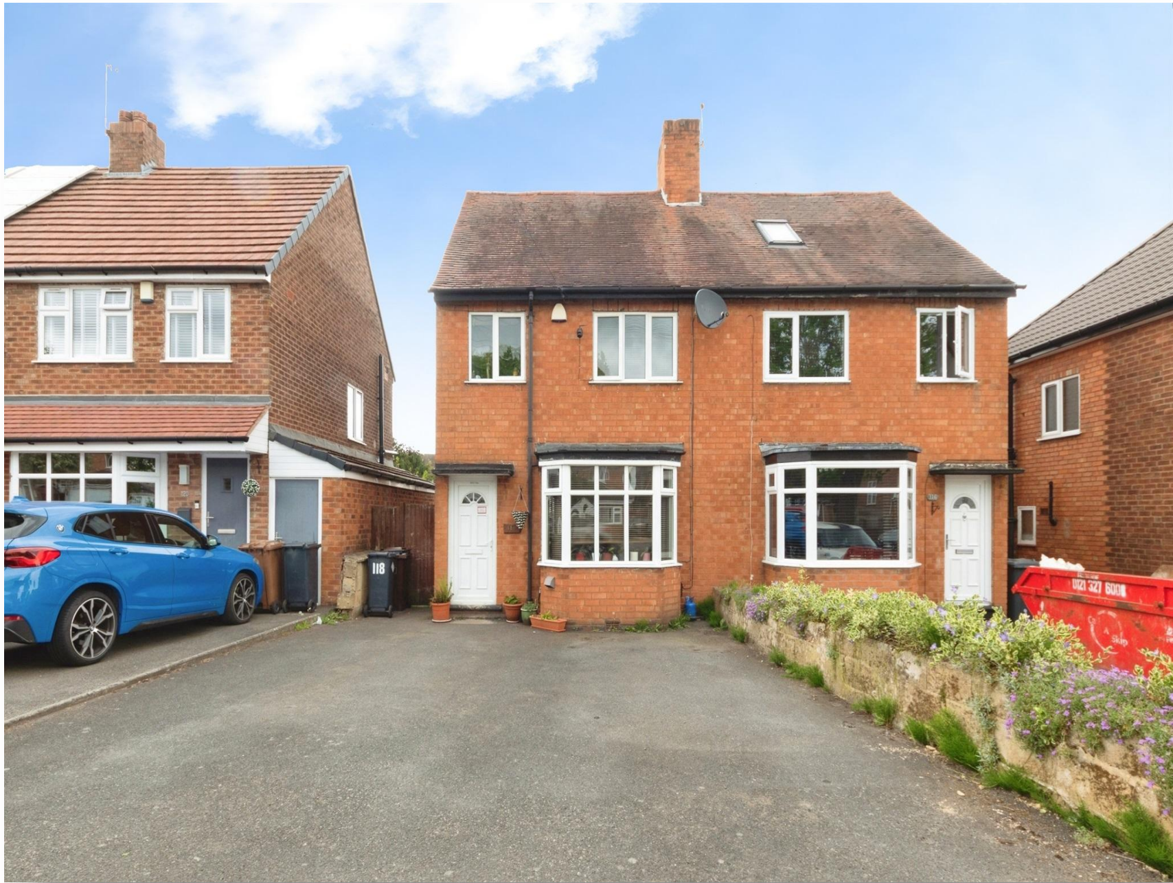
High Street, Shirley Solihull B90 1JS