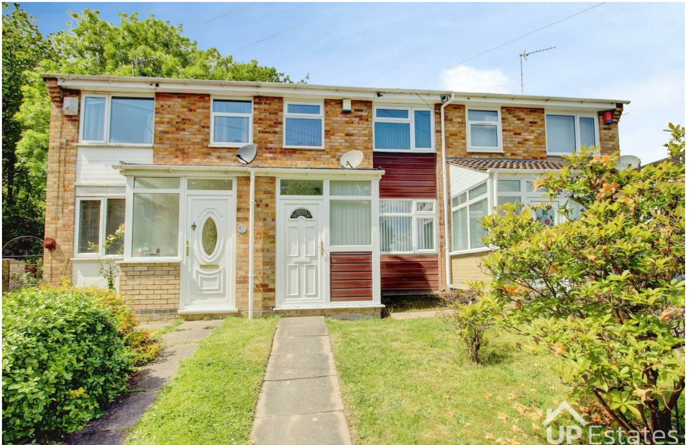
Hillfray Drive, Coventry