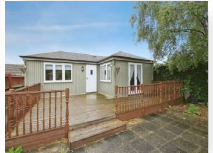
Church Close, Stilton Peterborough PE7 3RG