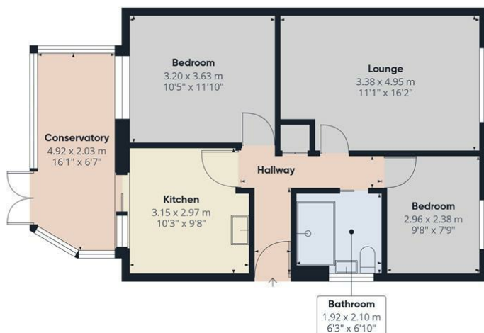
Floor 0 Building 1