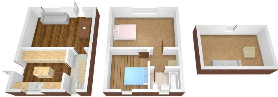
All measurements, designs and colours are approximate and for display purposes only