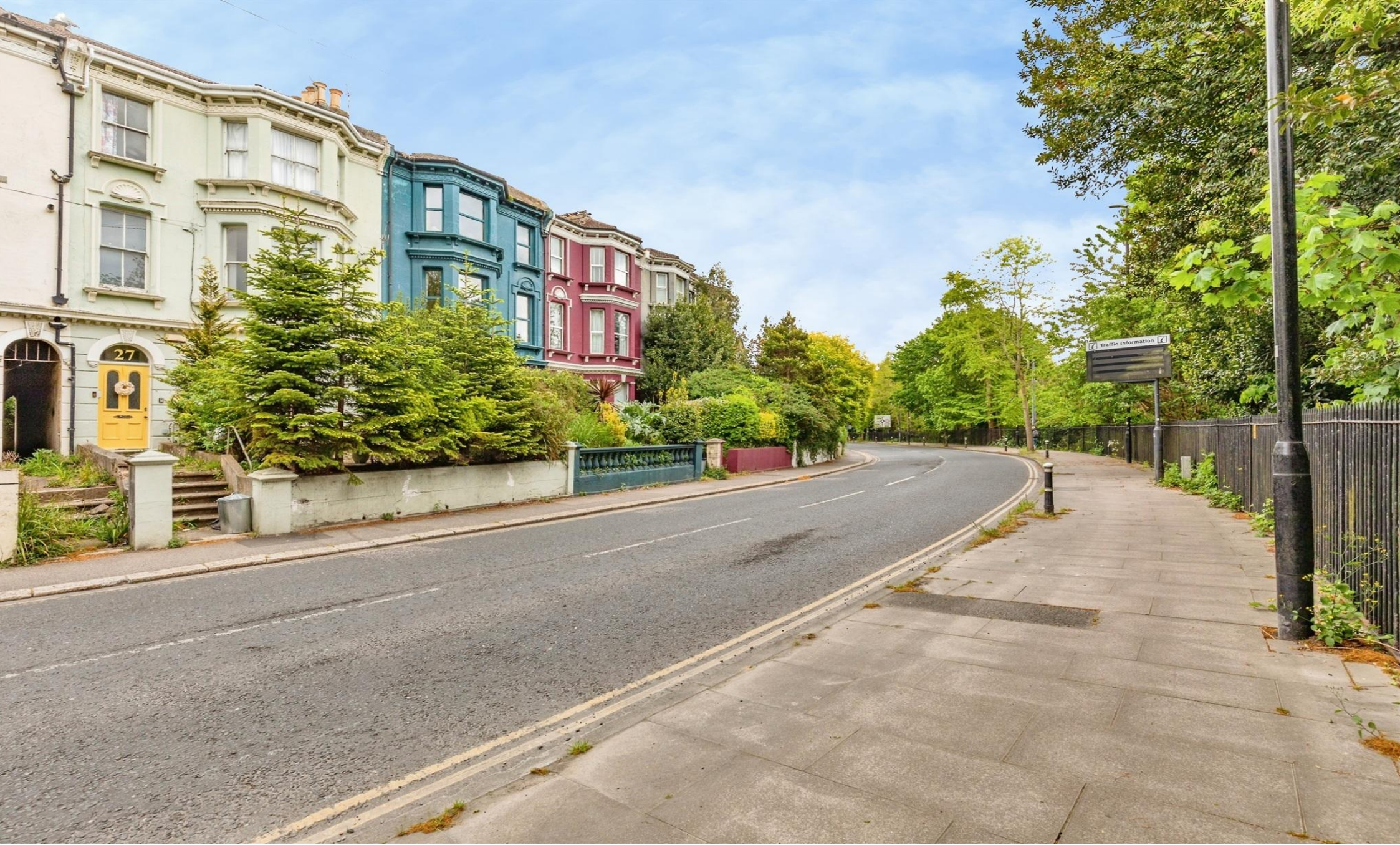
St. Helens Road, Hastings TN34 2LQ