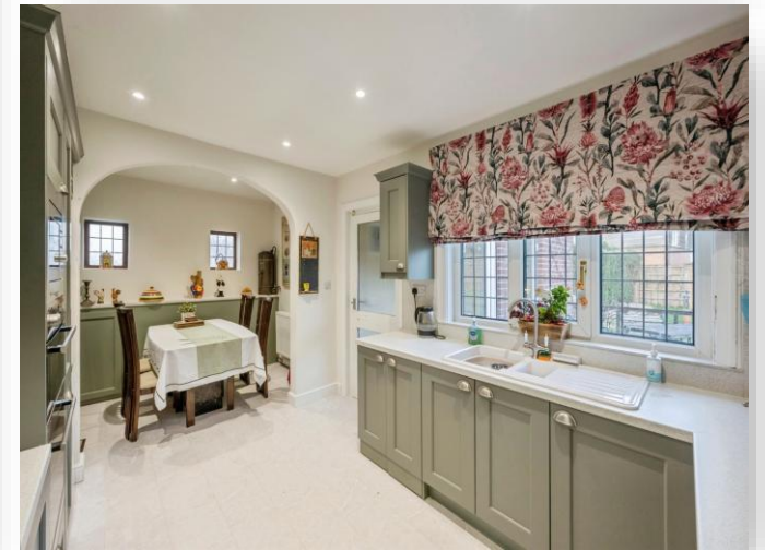
Sandygate, Wath-Upon-Dearne Rotherham S63 7NP