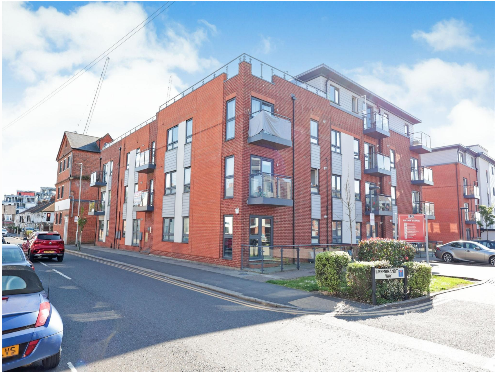
Lucas Court, Hagden Lane, Watford, WD18 7DH