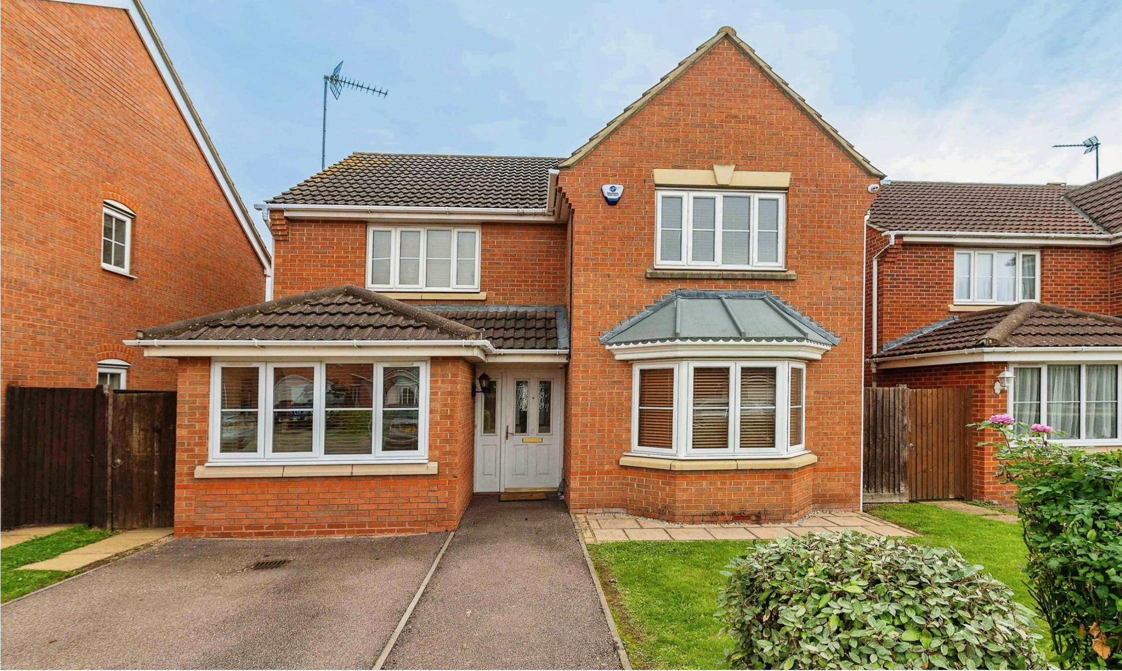
Lavender Close, Hatfield AL10 9FW