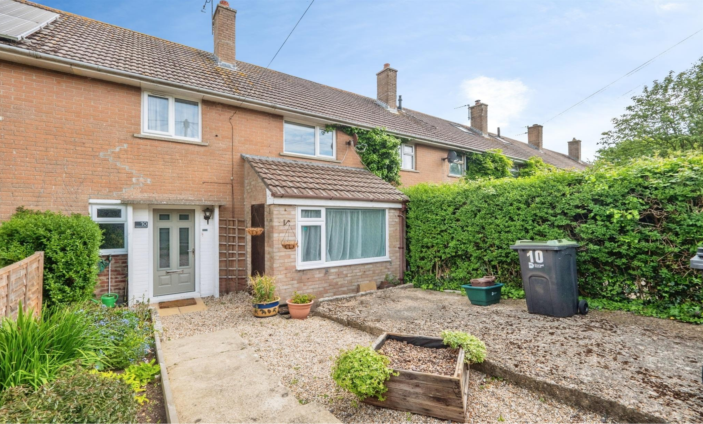
Canberra Crescent, WEYMOUTH DT3 6AQ