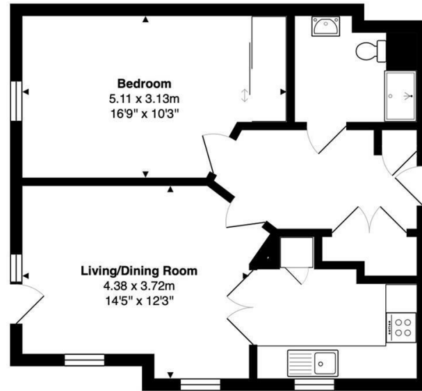
First Floor Area: 51.5 m 2 ... 554 ft 2

FOR ILLUSTRATIVE PURPOSES ONLY; NOT TO SCALE Whilst every attempt has been made to ensure the accuracy of the floor plan shown, all measurements, positioning, fixtures, features, fittings and any other data shown are an approximate interpretation for illustrative purposes only and are not to scale. No responsibility is taken for any error, omission, miss-statement or use of data shown. Property marketing provided by www.matthewkyle.co.uk