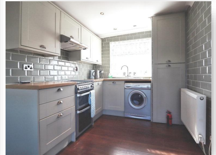
Lavernock Point Holiday Estate, Fort Road, Lavernock, Penarth, CF64 5XQ