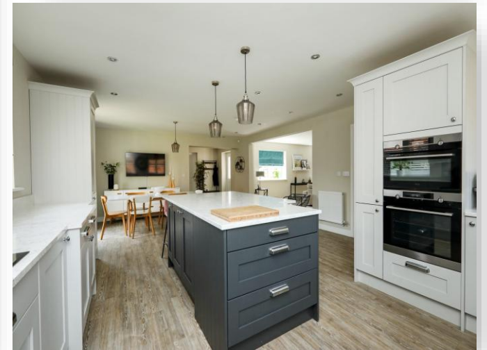
Brindley Grove, Sutton Retford DN22 8TF