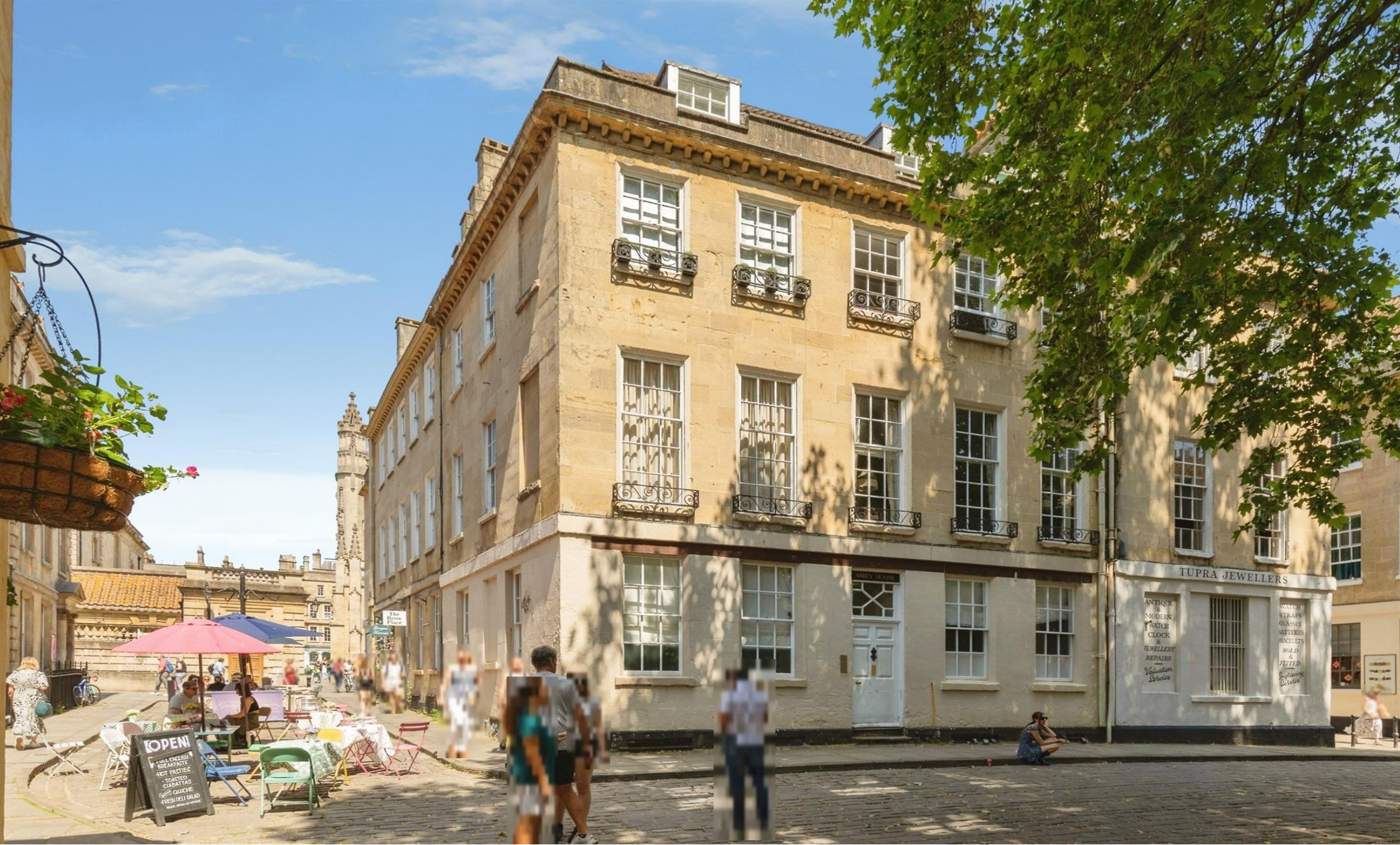
Abbey House Abbey Green, Bath BA1 1NR