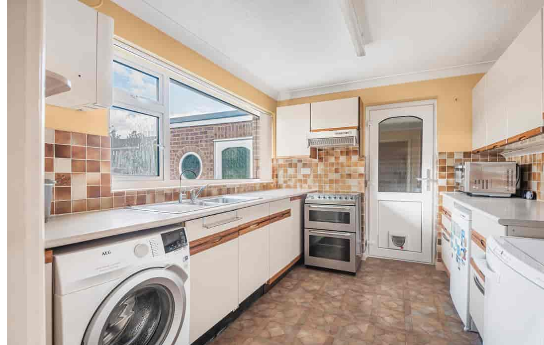
4 Badgebury Rise, Marlow, Buckinghamshire SL7 3QA Offers in Region of £650,000 - Freehold