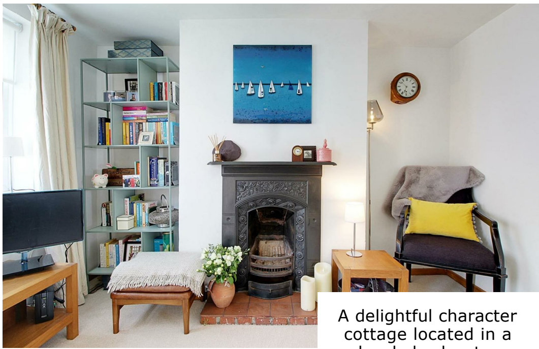
A delightful character cottage located in a lovely backwater location in the heart of the village.