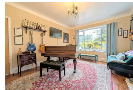
GOLF | CHARLOTTE HOUSE, GROUND FLOOR, 35-37 HOGHTON STREET, SOUTHPORT, MERSEYSIDE, PR9 0NS