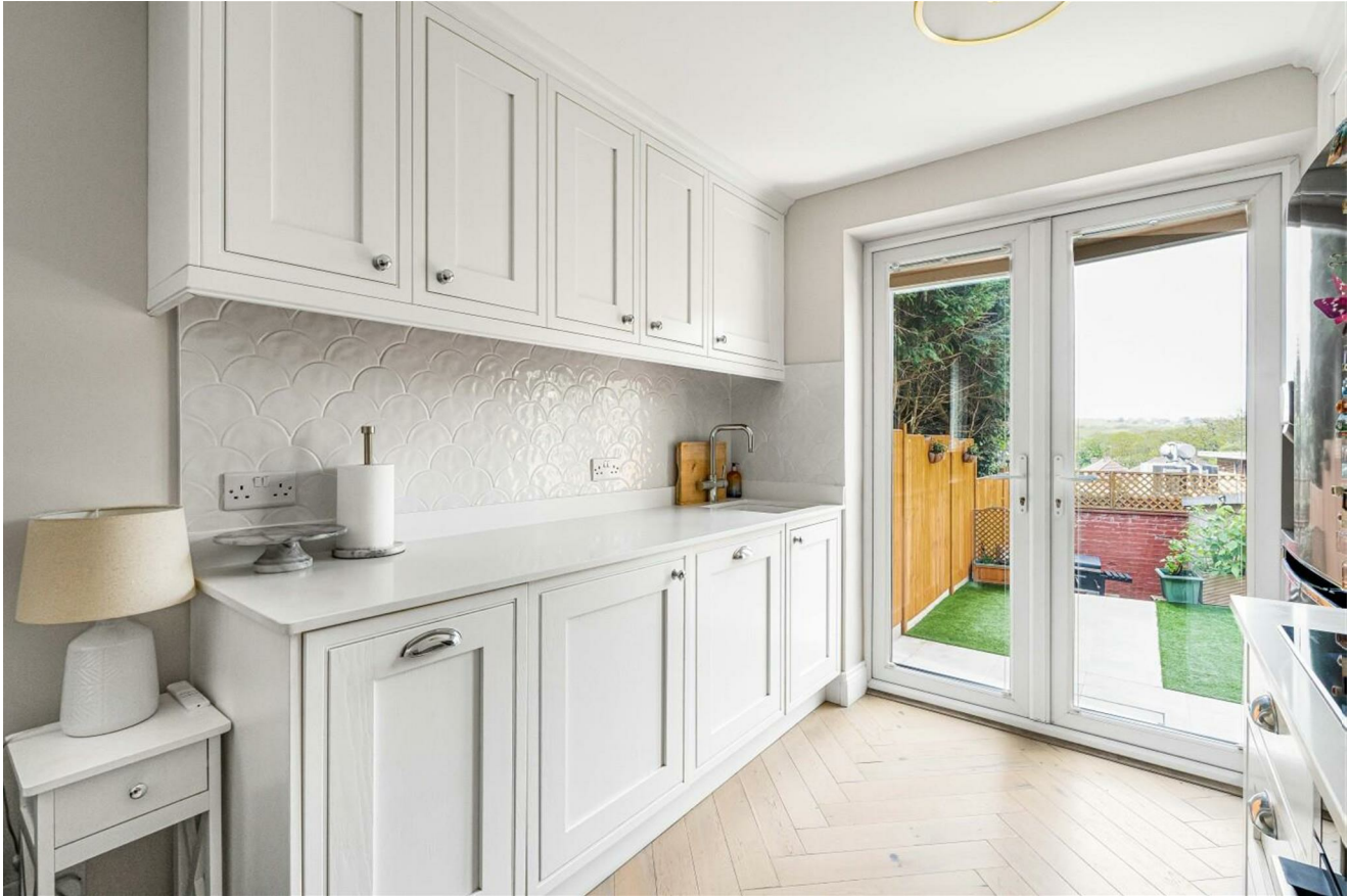
KITCHEN (pic 2)

French Doors to the rear with engineered wood herringbone flooring. Shaker style floor & wall units, tiled splashbacks. Ceramic hob with extractor above, undermount Butler sink, undercounter oven, integrated dishwasher & washing machine. Underfloor heating.