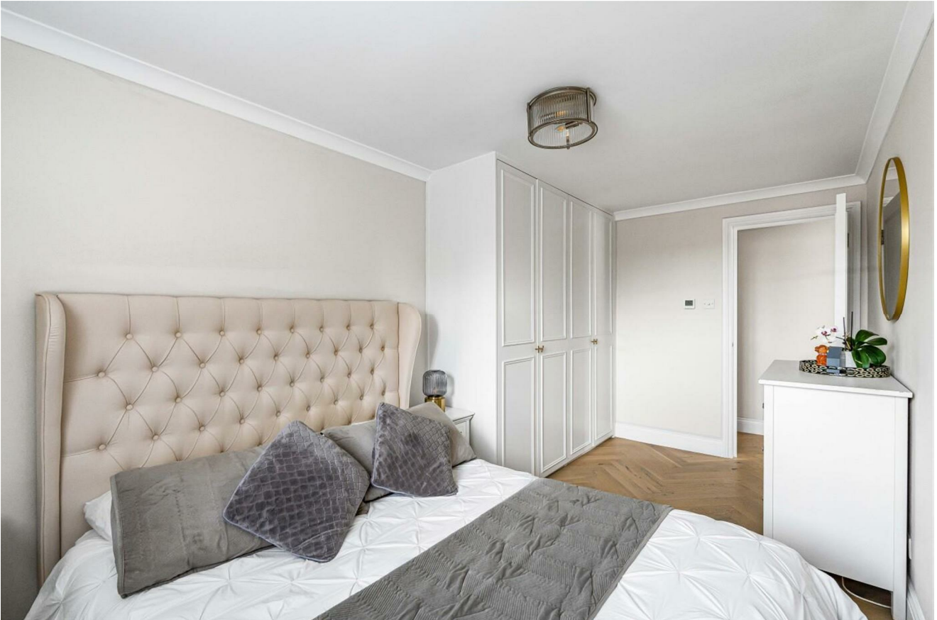
BEDROOM 2 8'10 x 6'0 (2.69m x 1.83m)

Double glazed window to the side, engineered wood herringbone flooring. Underfloor heating & coving to the ceiling.