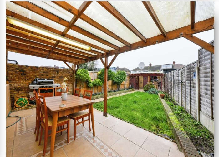
Lodge Crescent, Waltham Cross EN8 8BL