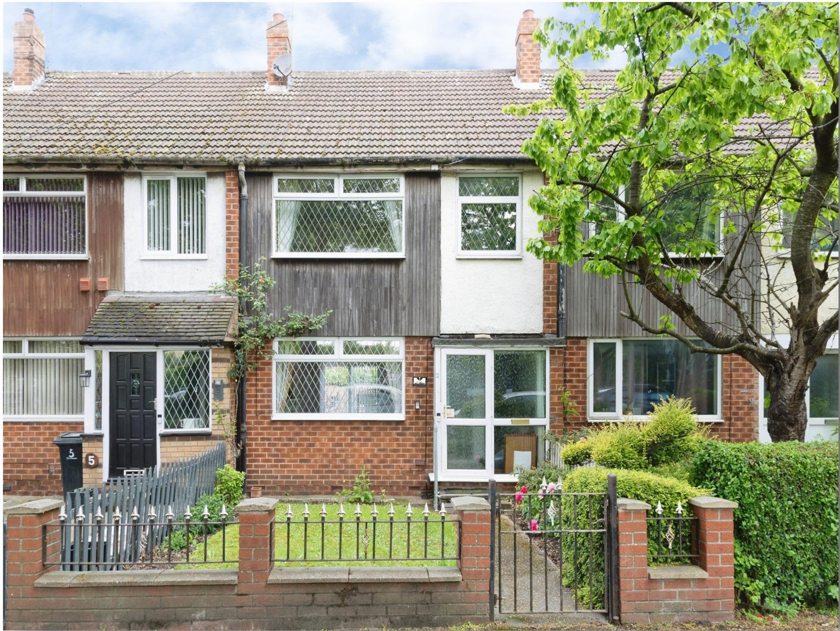
Marfleet Lane, Hull, HU9 5RJ