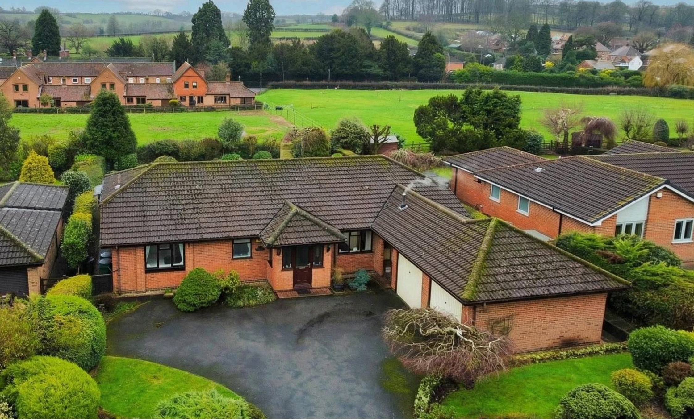
7 Broad Close, Woodborough – NG14 6BY Asking Price £495,000