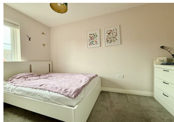
Bedroom 4 11'11 x 6'8 (3.63m x 2.03m)