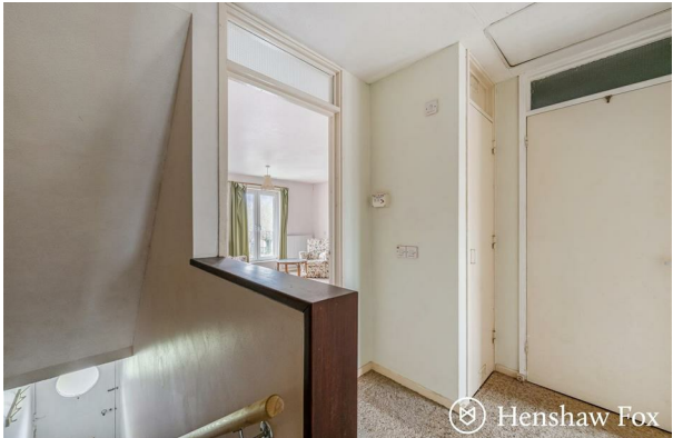
34 Odiham Close | £120,000 Lordshill, Southampton, SO16 8JL