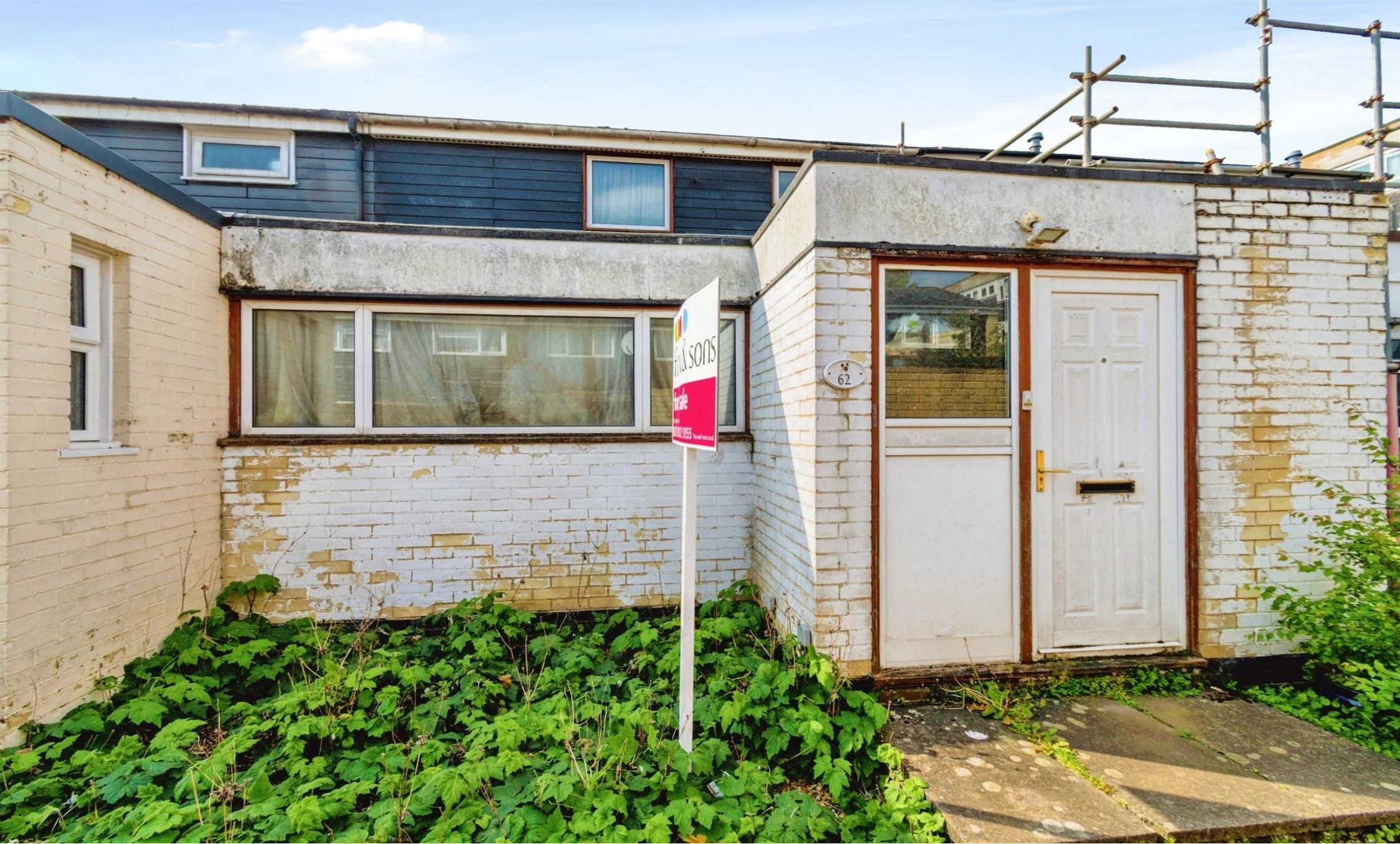
Howards Grove, Southampton SO15 5PU