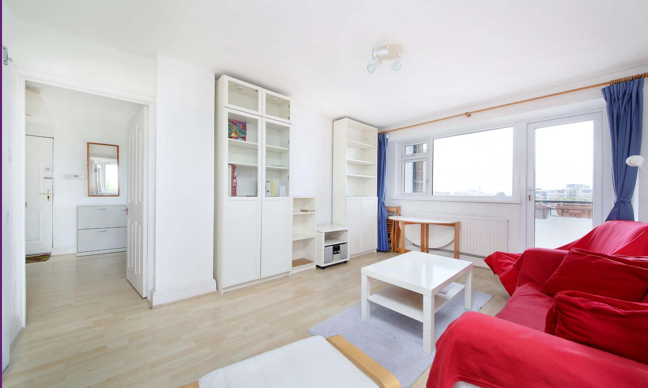
Lindsay Court Battersea High Street, SW11