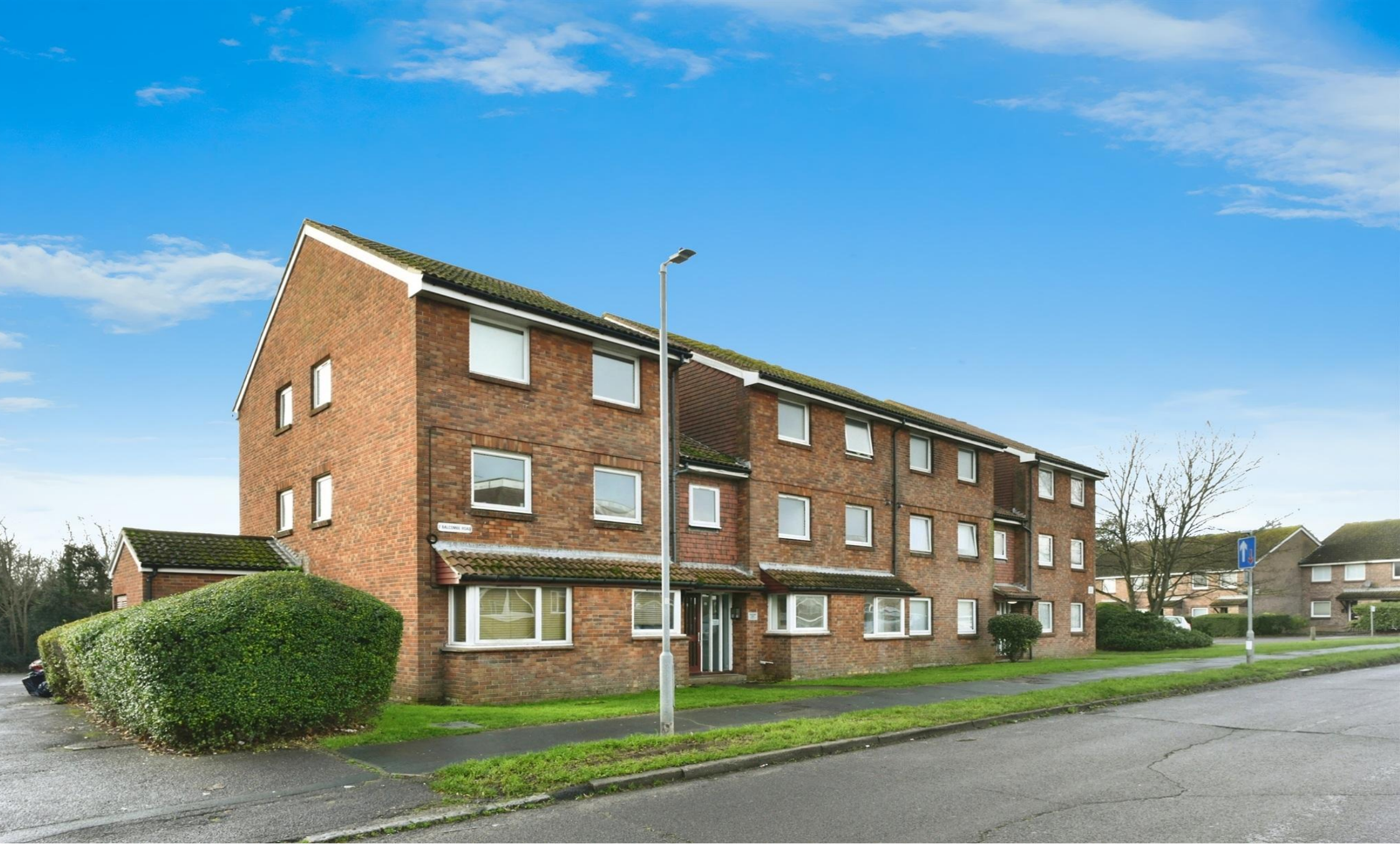
Balcombe Road, Peacehaven BN10 7QF