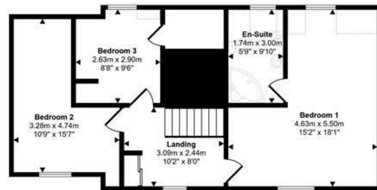
First Floor Approx 60 sq m / 646 sq ft