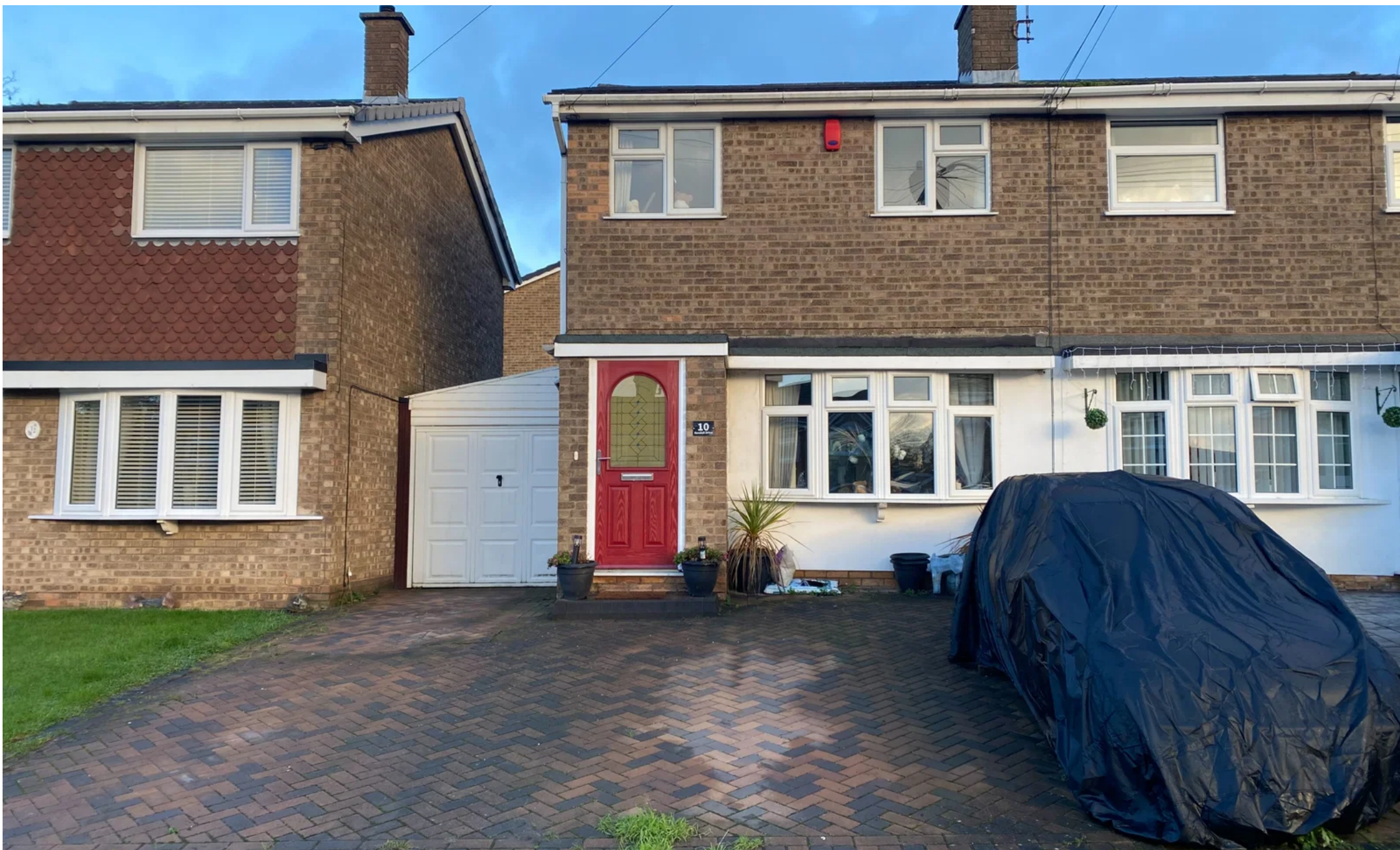
Randall Drive, Swadlincote, DE11 Swadlincote