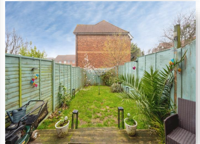
Glen Road, Southampton SO19 9EJ