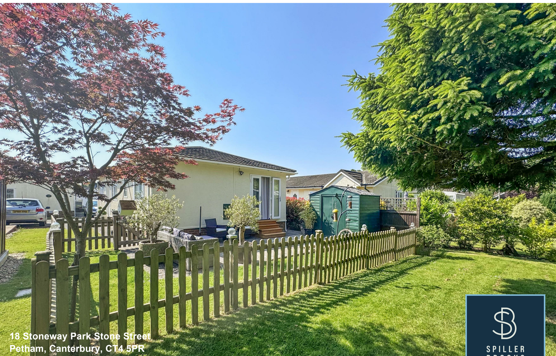
18 Stoneway Park Stone Street Petham, Canterbury, CT4 5PR