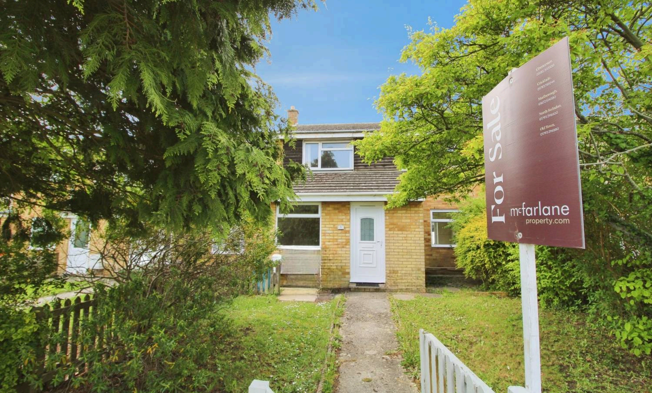
5 Dorset Green Swindon