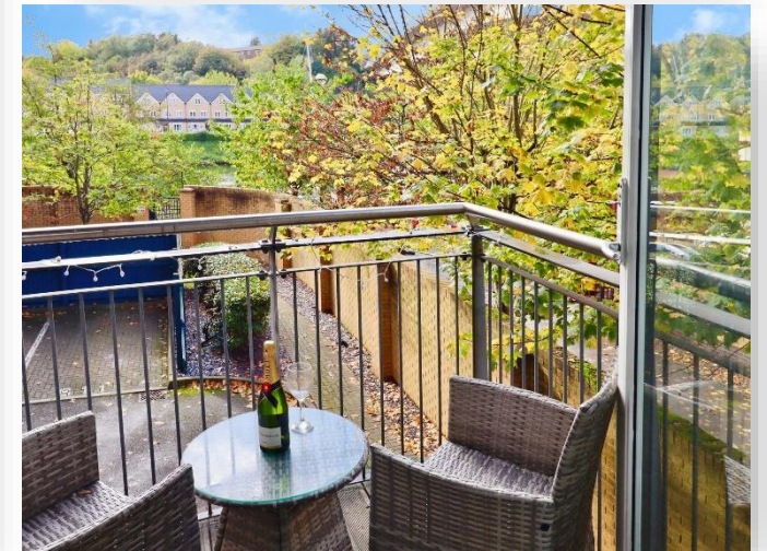
Beatrix, Victoria Wharf, Cardiff, CF11 0SE