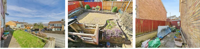
Stepped front garden. Paved side access to rear garden with lawn and raised beds.